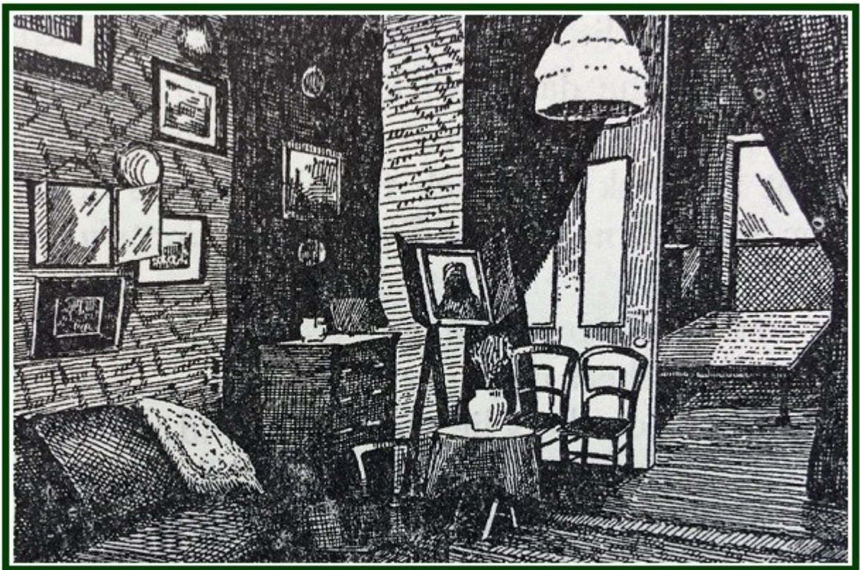
Partial view of the image made by Mr. Judge

Drawing with pen and ink, William Q. Judge made an image to show the office of Helena P. Blavatsky in Lansdowne Road, Holland Park, London, in 1887-1888.